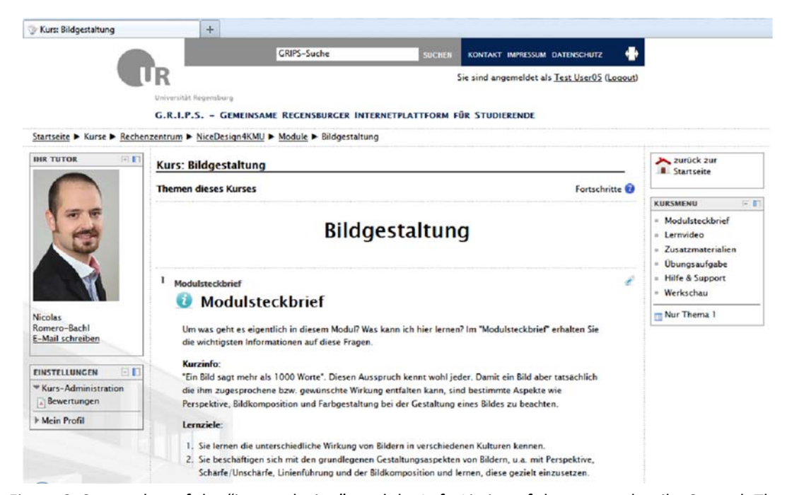
Figure 2. Screenshot of the "image design" module. Left: Listing of the course details. Central: The module's content area. Right: Navigation tools.

The videos follow a common routine. First, a moderator introduces the module and then the video transitions to focus on the meaning of the module title. The content includes a typical real world problem, exemplified by an employee of an enterprise who attempts to solve it according to clearly formulated goals. The components of the solution procedure are presented to the learner in sequence. Components could be design standards and rules and actions that demonstrate them. Knowledge of design is utilized and skills used to produce results. Finally, the moderator reappears and concludes the video.