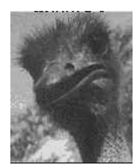
Figure 6: A personality for the peer evaluation programme

You maintained a very high level of consistency across your evaluations. This level of reliability earned you 25 credits. You achieved a high standard in your own essay but you applied an average standard when evaluating your peers' essays. It seemed you expected slightly less of your peers than what you required of yourself. This meant you were not entirely congruent in how you applied standards. This level of congruency earned you only 5 additional credits.