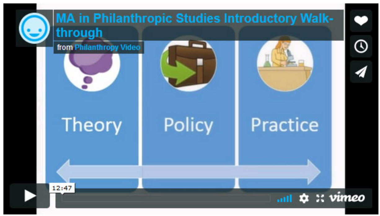
MA in Philanthropic Studies Introductory Walkthrough from Philanthropy Video on Vimeo.

In the video, students are shown brief clips of how to navigate various elements of the Moodle, and what happens when you click on links and open files or built-in internal components such as quizzes (Fitton, 2018; 09:40), and external components housed within Moodle such as the TedEd example (09:53). As explained in the video, various tasks are colour coded to indicate what is "essential", what is "recommended" and what is "wider" reading. This is a form of "teacher-directed learning" (as opposed to "student-directed learning") designed to reduce the complexity of online learning which, although often lauded as providing more flexibility, can negatively affect student learning experiences (Cagiltay et al., 2006; p.125).